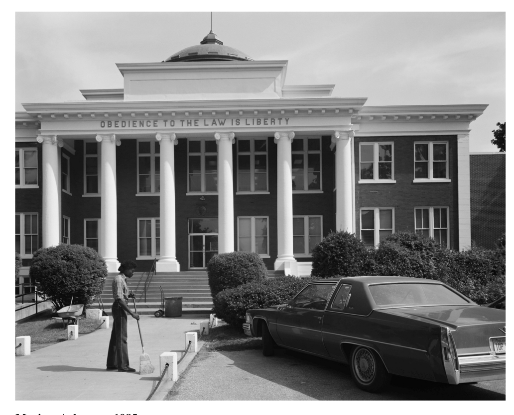
Marion, Arkansas, 1985