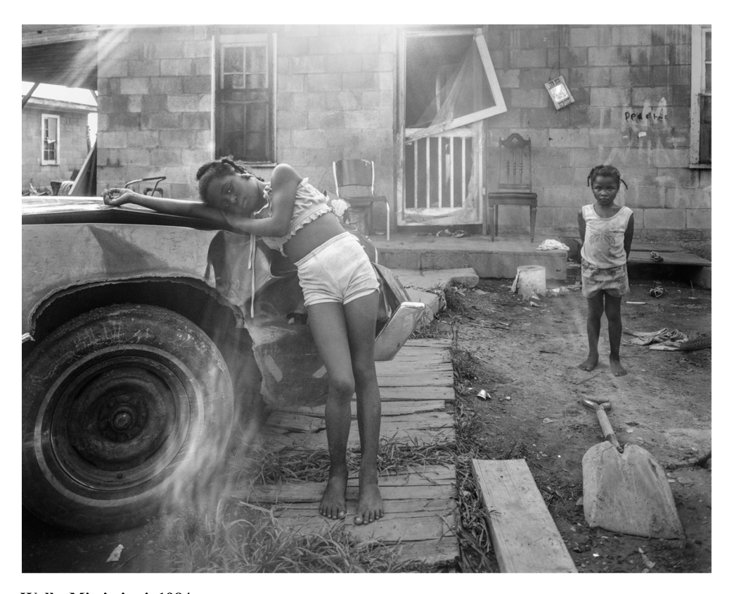
Walls, Mississippi, 1984