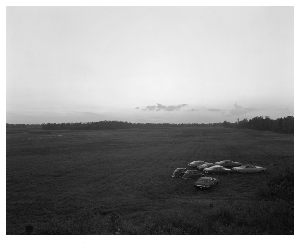
Montgomery, Alabama, 1984