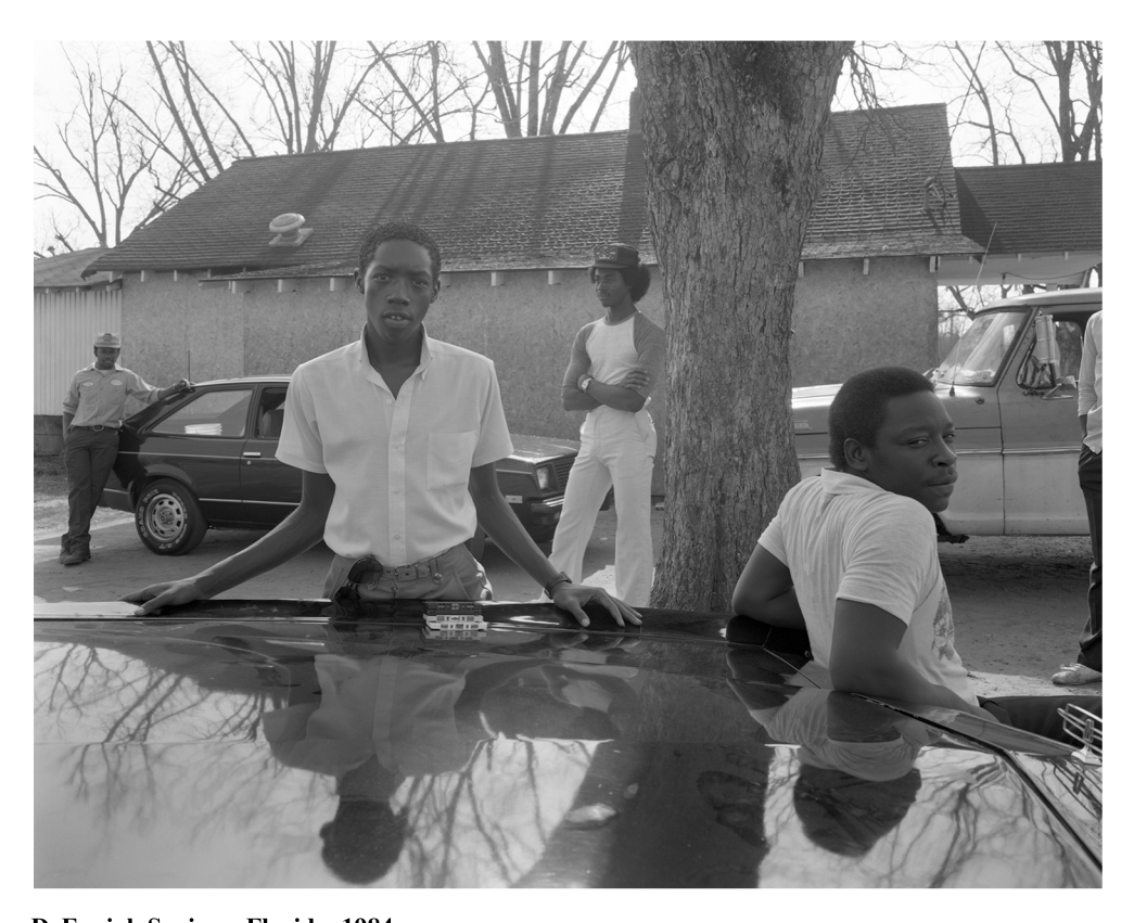
DeFuniak Springs, Florida, 1984