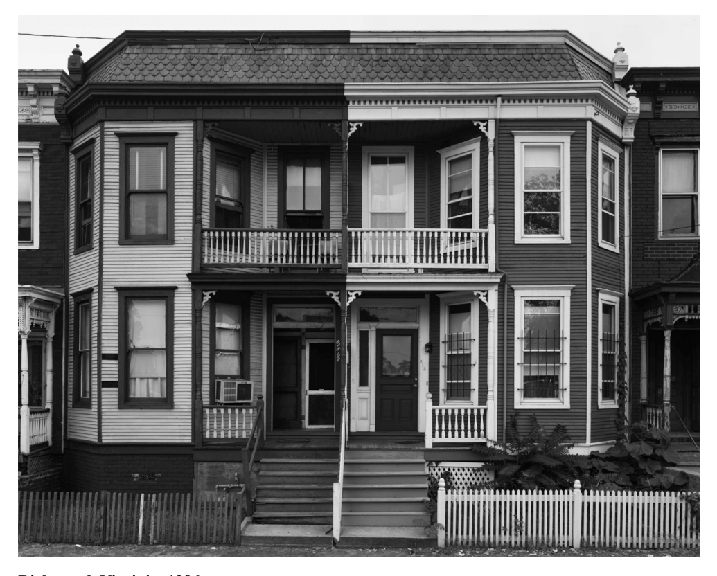
Richmond, Virginia, 1986

'A stunningly wrought group of photographs that are artistic to the highest degree.' The Washington Post