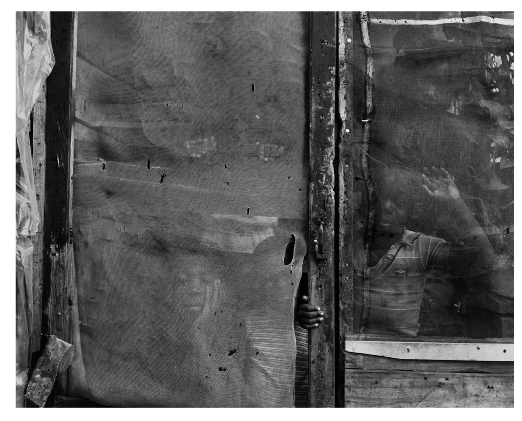
Rosedale, Mississippi, 1984