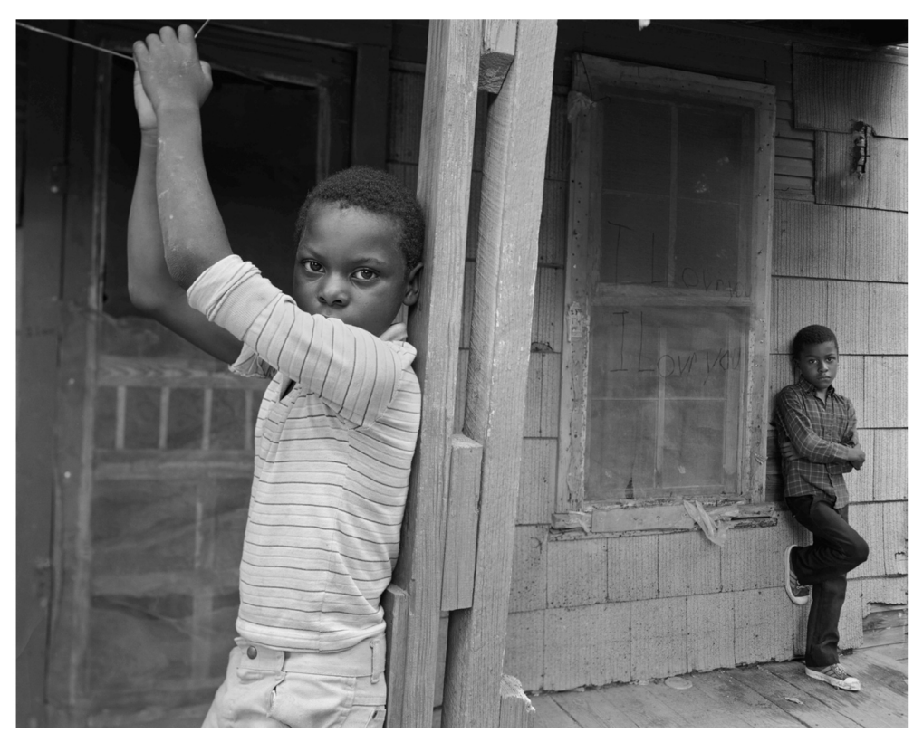
Boyle, Mississippi, 1985