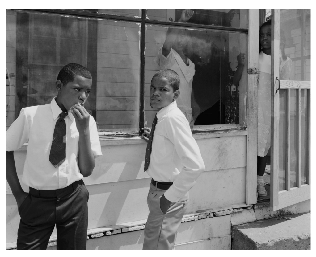
Rosedale, Mississippi, 1984