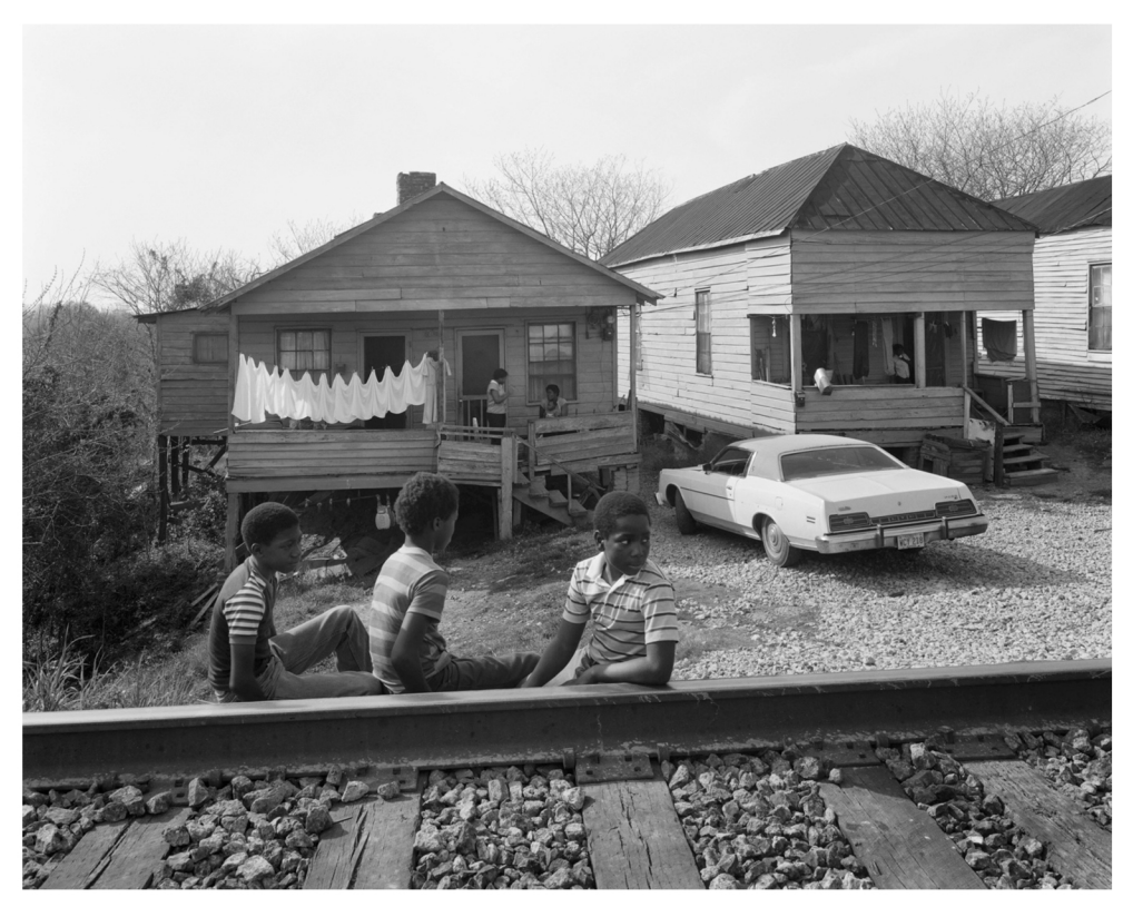
Vicksburg, Mississippi, 1984