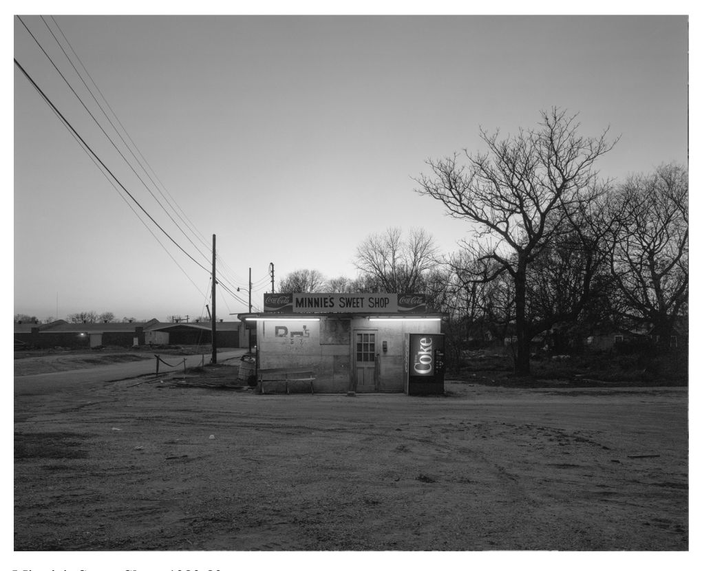
Minnie's Sweet Shop, 1983-89

'In the 1980s an unknown photographer from New York travelled through the US capturing life in Black communities. Now these mostly unseen pictures have made him a star.' The Guardian