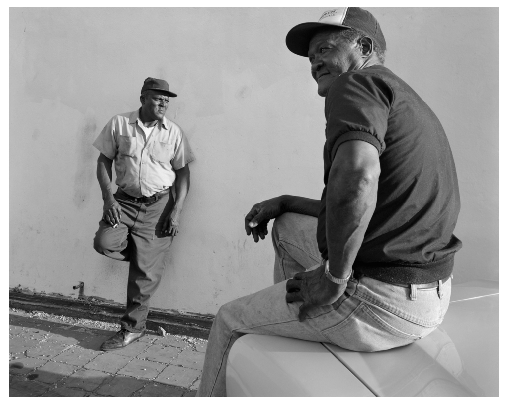
Baton Rouge, Louisiana, 1985