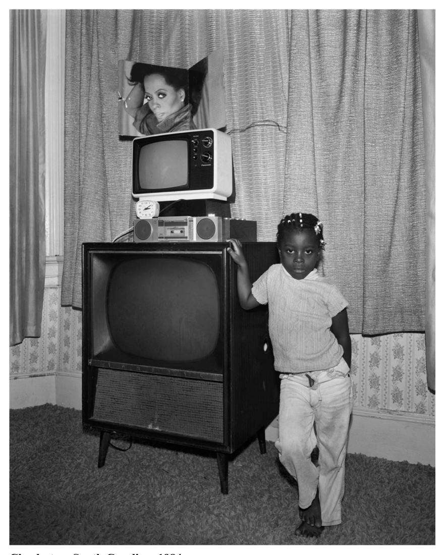
Charleston, South Carolina, 1984