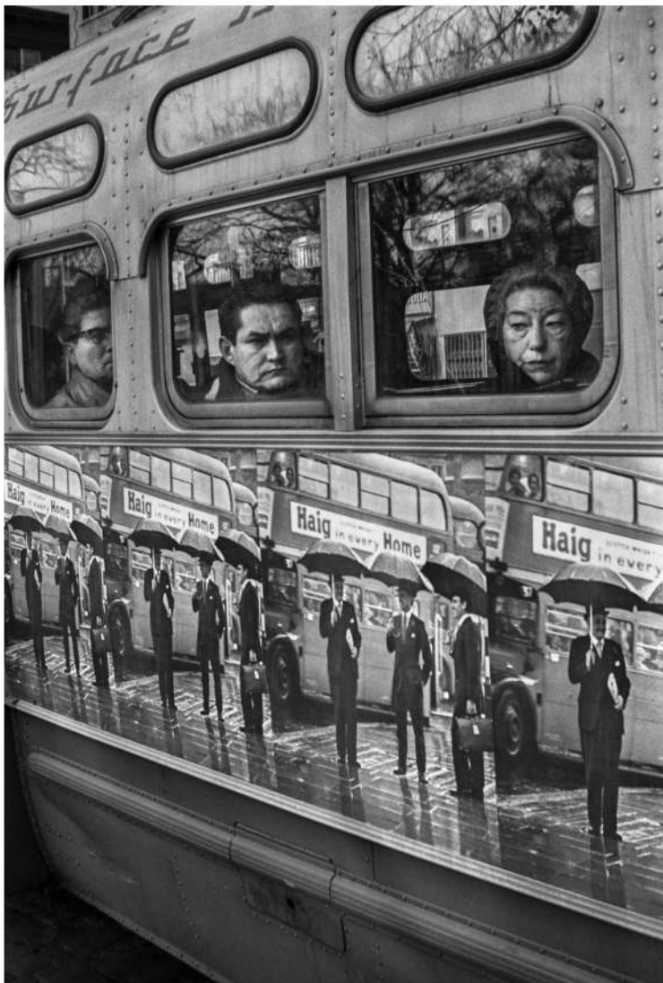
8th Street Crosstown Bus, New York, November 1965