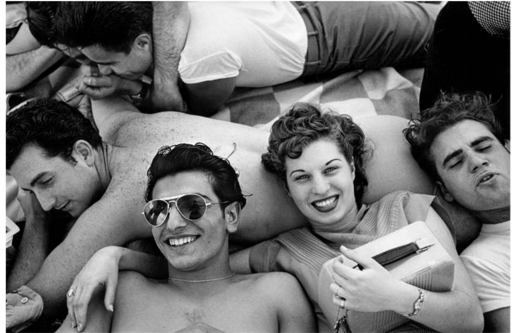
Coney Island Teenagers, Coney Island, 1949 20 x 24 in. (50.8 x 61 cm) fibre-based silver gelatin print, printed 2014 Signed by the artist in ink on recto GBP 6,625 inc. VAT, unframed / USD 7,800 for export

‘Feinstein established himself as an eagle-eyed observer of city life, matching exquisite black-and-white compositions with a rare command of printing.’ The Guardian