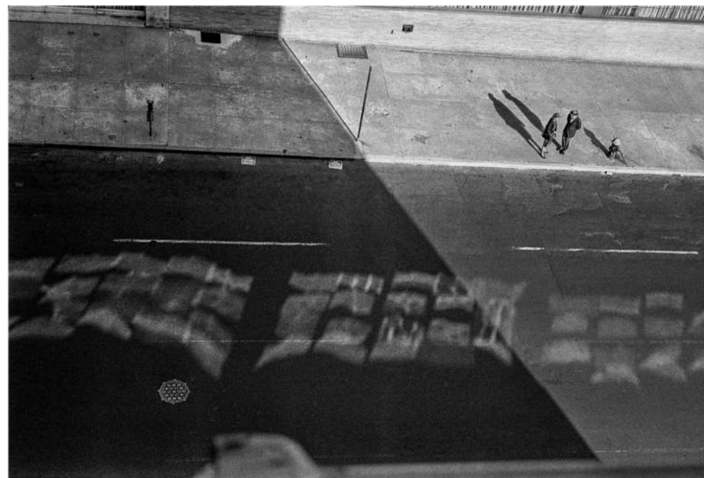
Amsterdam Avenue, New York, May 1962