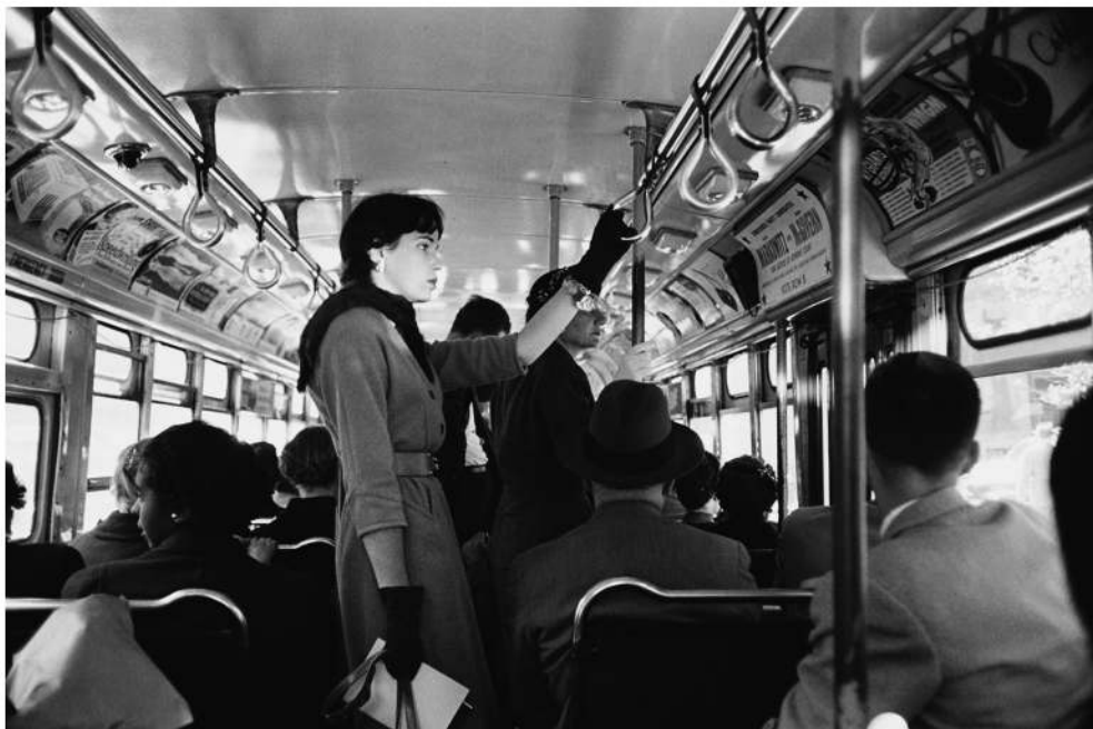
Bus Commute, New York, 1953