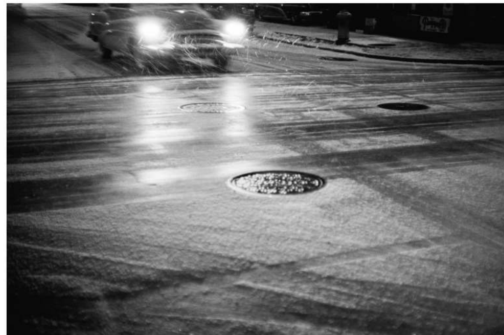
Car in Snowfall, New York, 1953