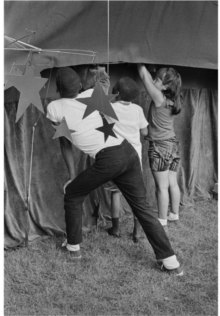
The Star is For You, New York, July 1967