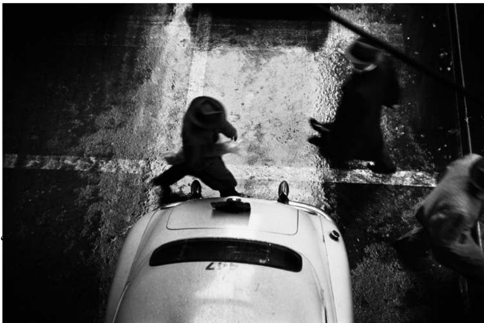
Madison, New York, 1953