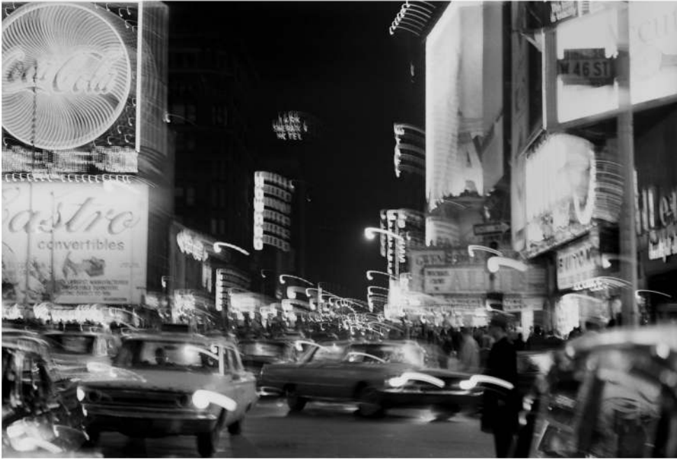
Broadway and Times Square at Night, New York, 1966