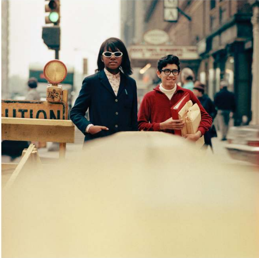
Fashion Students, New York, 1966