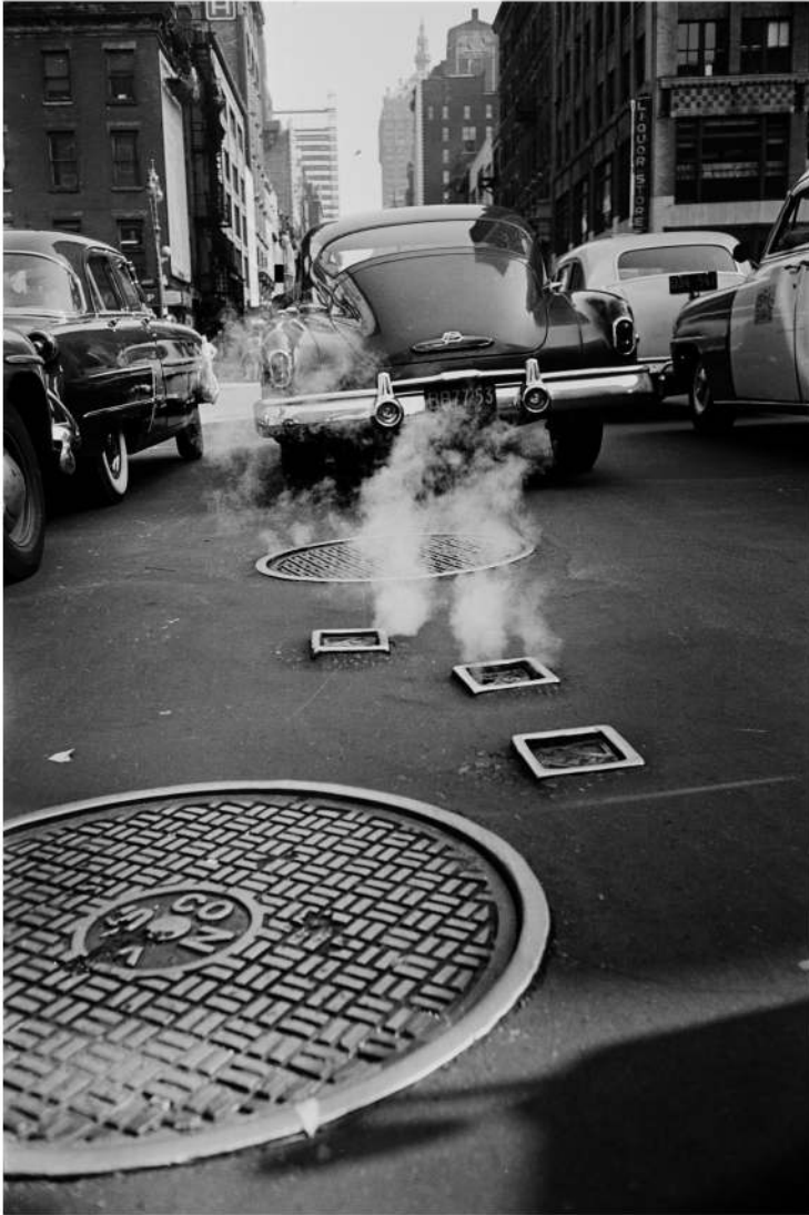
Steam Escapes, New York 1953

Werner Bischof was born in Switzerland. He studied photography with Hans Finsler in his native Zurich at the School for Arts and Crafts, then opened a photography and advertising studio. In 1942, he became a freelancer for Du magazine, which published his first major photo essays in 1943. Bischof received international recognition after the publication of his 1945 reportage on the devastation caused by the Second World War.