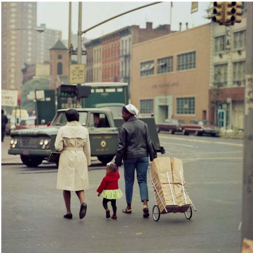
Grocery Shopping, Harlem, New York, 1966