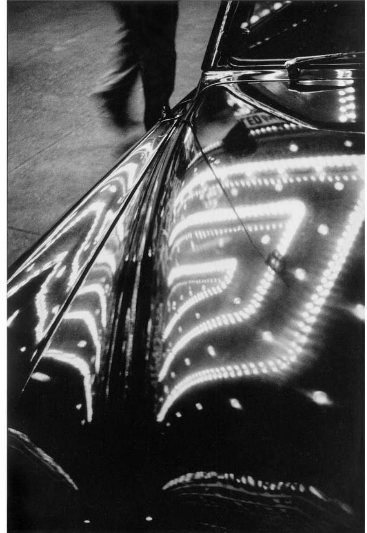
Times Square Lights Reflected on Car, New York, 1953 20 x 16 in. (50.8 x 40.6 cm) fibre-based silver gelatin print, printed 2009 Signed by the artist in ink on recto GBP 5,100 inc. VAT, unframed / USD 6,000 for export