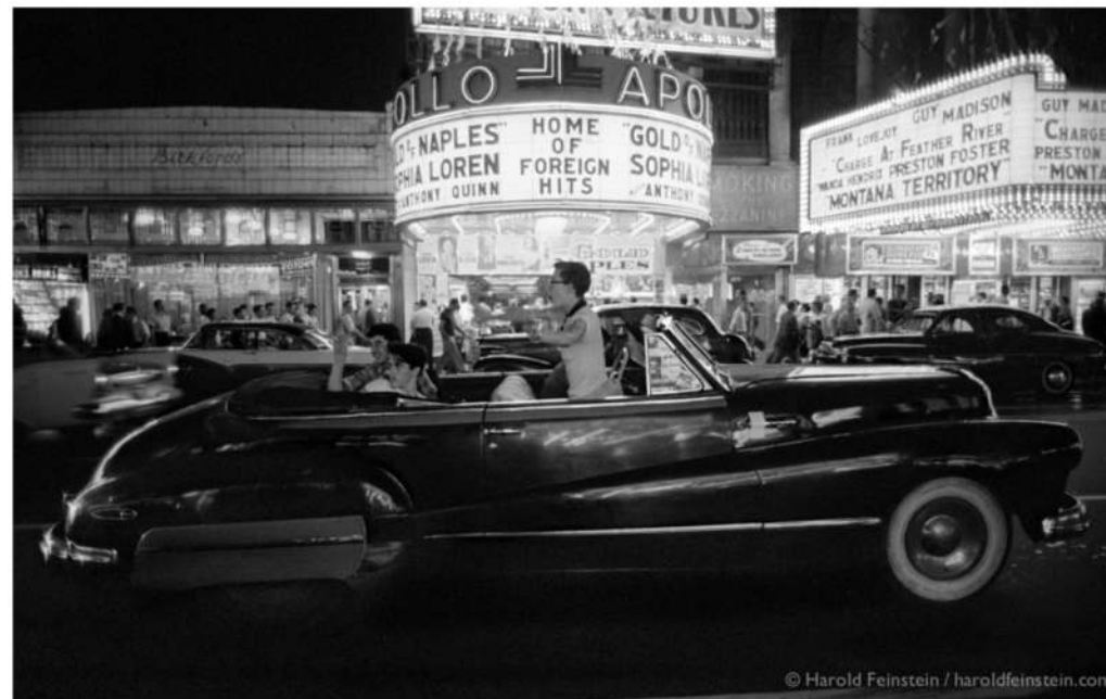
Cruisin' on Saturday Night, Brooklyn, 1957 16 x 20 in. (40.6 x 50.8 cm) fibre-based silver gelatin print, printed 2012 Signed by the artist in ink on recto GBP 4,675 inc. VAT, unframed / USD 5,500 for export