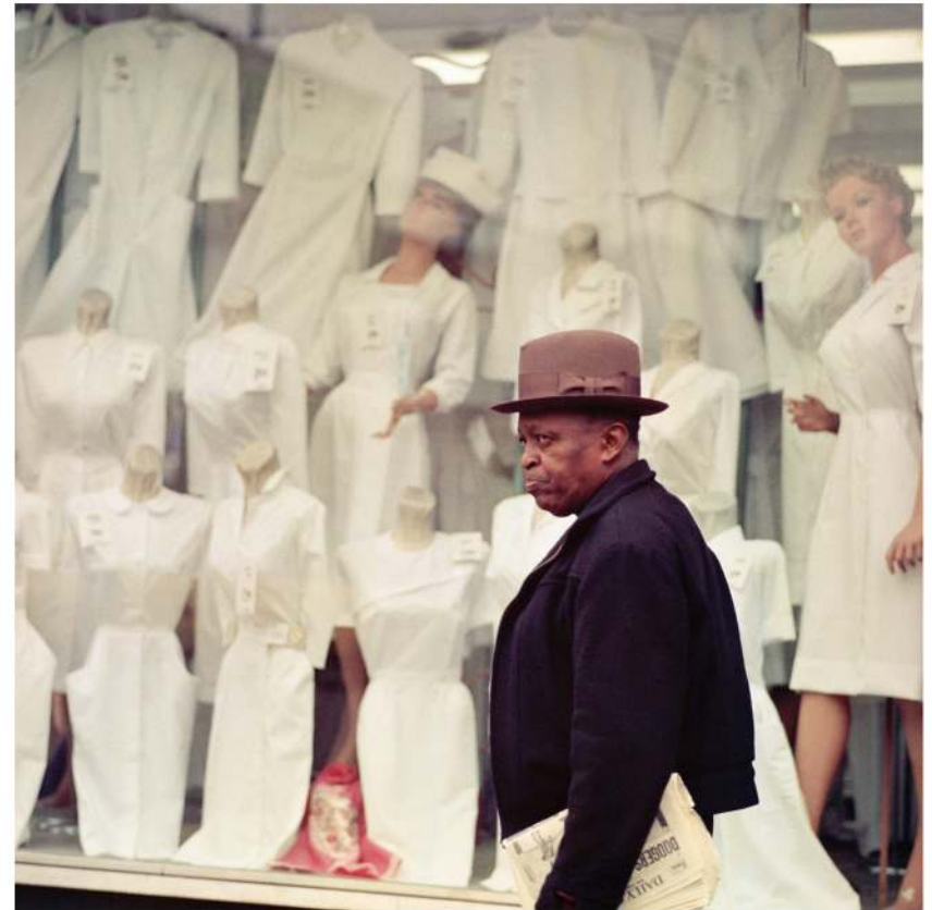
Nurses Outfitters, New York, 1966