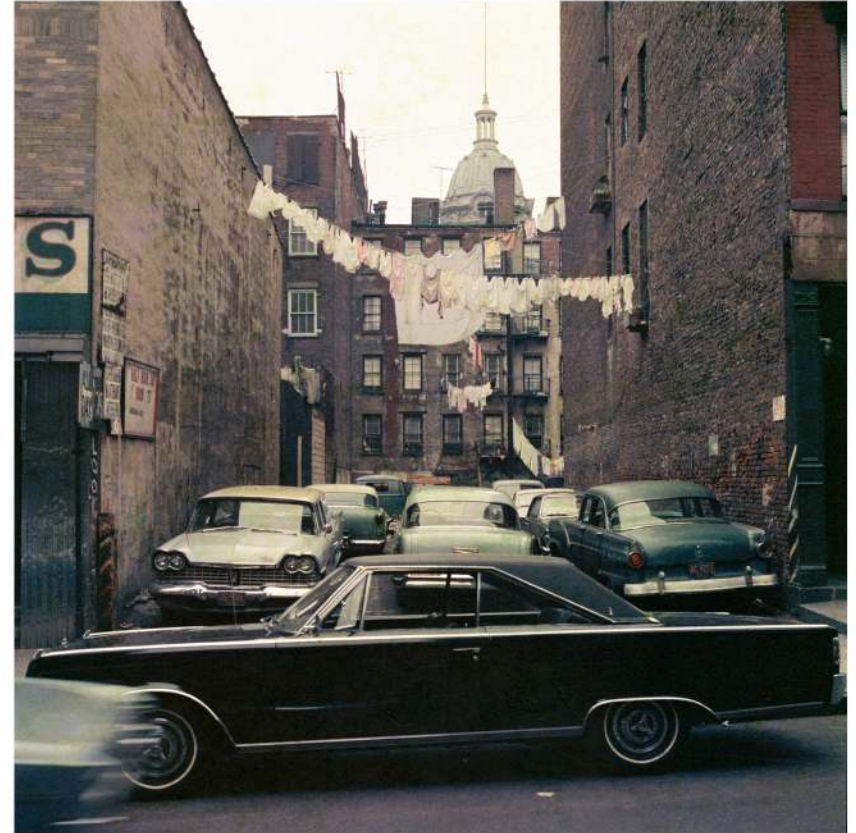
Black Plymouth Belvedere, Brooklyn, New York, 1967