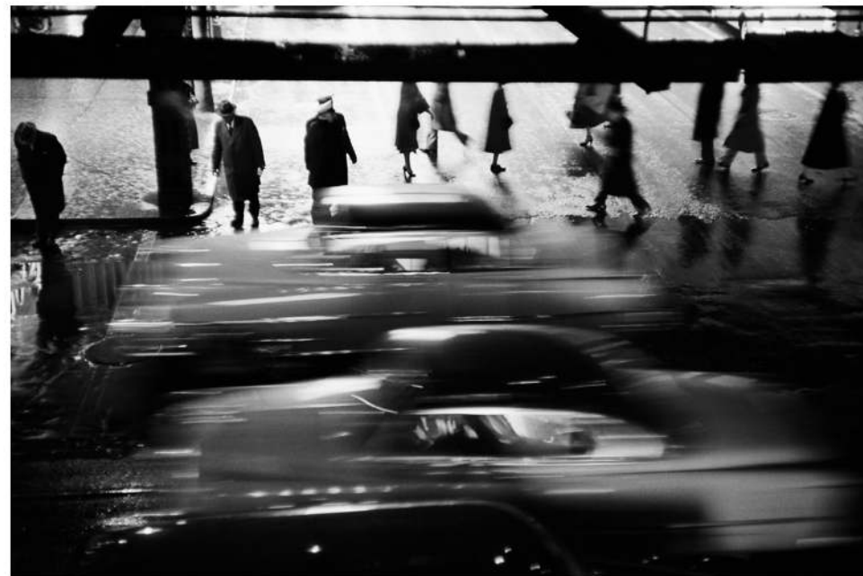
Rushing Cars, New York, 1953