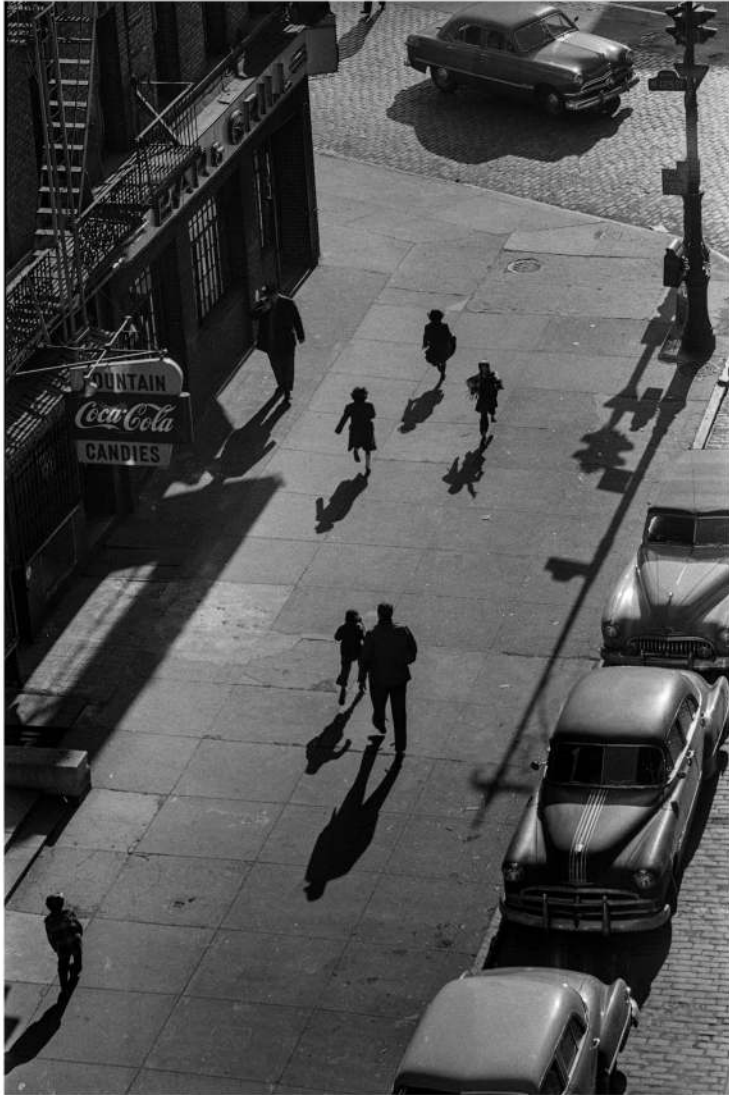
125th Street from Elevated Train, New York, 1950 20 x 16 in. (50.8 x 40.6 cm) fibre-based silver gelatin print, printed 2012 Signed by the artist in ink on recto GBP 4,250 inc. VAT, unframed / USD 5,000 for export