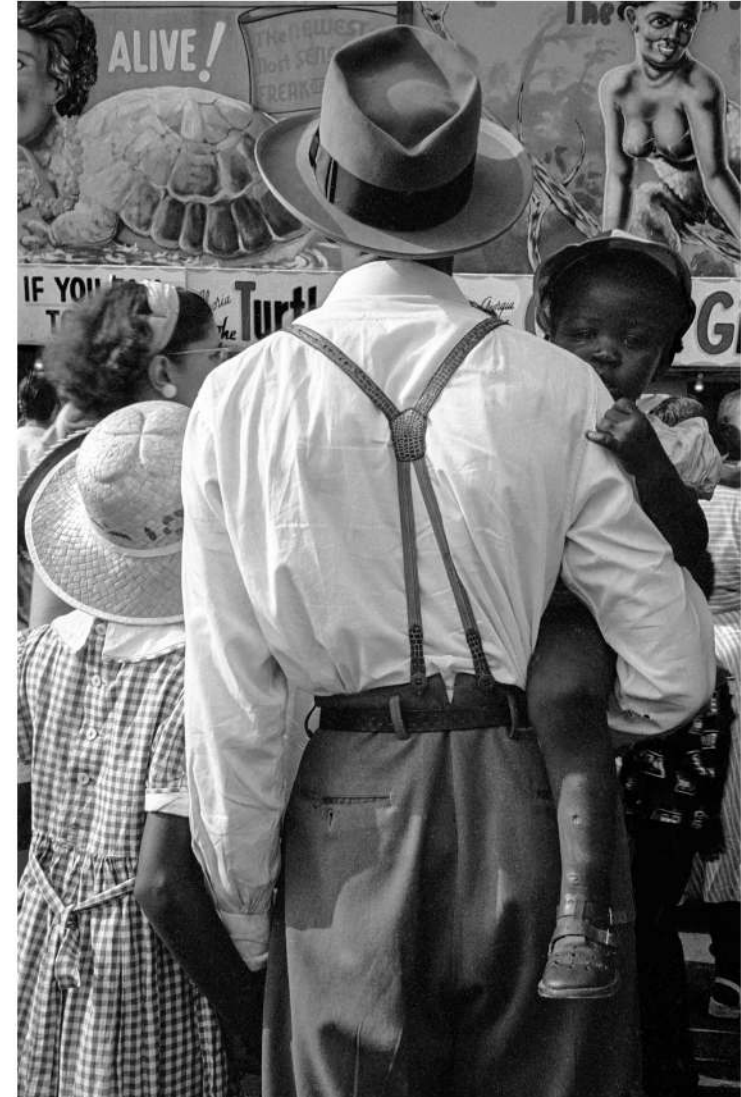
Man and Daughters at the Sideshow, Coney Island, 1950 20 x 16 in. (50.8 x 40.6 cm) fibre-based silver gelatin print, printed 2009 Signed by the artist in ink on recto GBP 3,825 inc. VAT, unframed / USD 4,500 for export