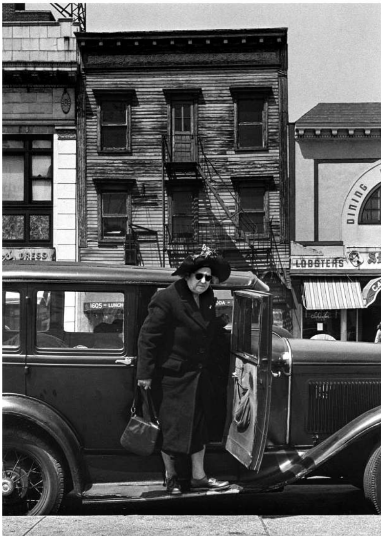
Woman Stepping Out of Car, New York, 1947 14 x 11 in. (35.6 x 27.9 cm) fibre-based silver gelatin print, printed 1970s Signed by the artist in ink on recto GBP 5,100 inc. VAT, unframed / USD 6,000 for export

While influenced by the likes of W. Eugene Smith and Henri Cartier-Bresson, Feinstein was not a photographer who would stand back and observe, unnoticed by his subjects. In fact, in nearly every image, Feinstein's proximity to his subject is clear. It is this physical closeness, an extension of Feinstein's profound connection to his subjects, that sets his work apart from other street photographers from the same period. Whether standing over a group of teenagers lying on a Coney Island beach, photographing a couple on the boulevard, or capturing the immutable gaze of a young child, intimacy and compassion sit at the core of each image.