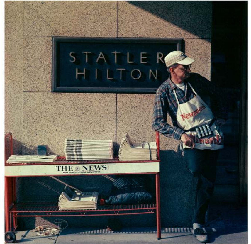
Newsstand, New York, 1966