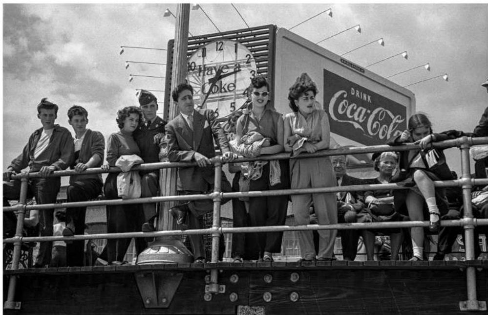
Coke Sign on the Boardwalk, Coney Island, 1949 11 x 14 in. (27.9 x 35.6 cm) fibre-based silver gelatin print, printed 1970s Signed by the artist in ink on recto GBP 7,650 inc. VAT, unframed / USD 9,000 for export