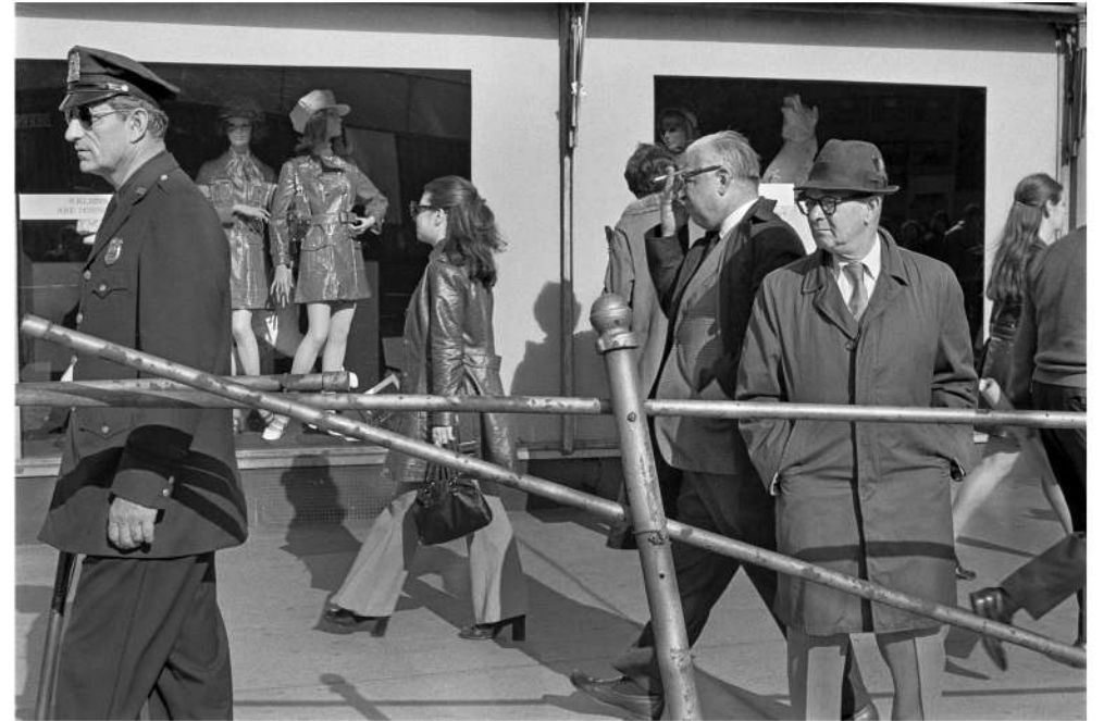
Convergence, New York, October 1972

'I photograph because I live. I want to contribute that passion of living to posterity in the best way I can.' Larry Fink