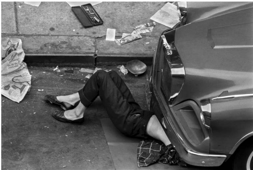
12th Street from the Window, New York, April 1964