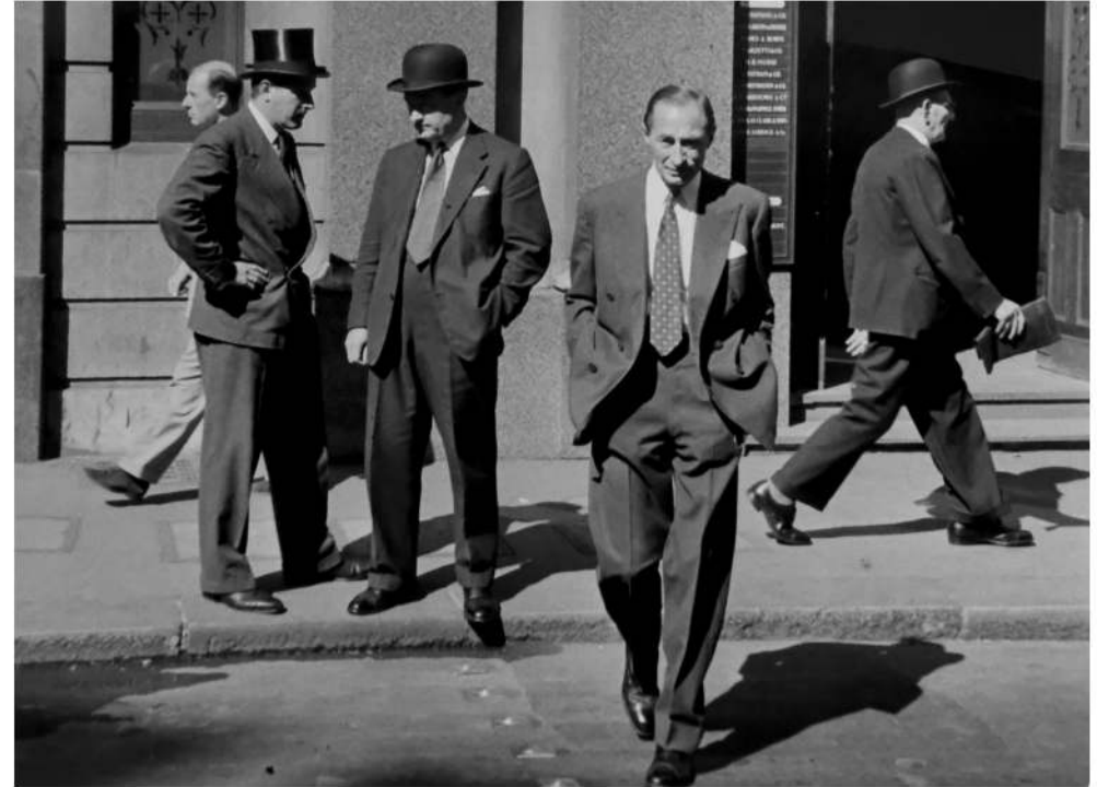
In Front of the Stock Exchange, New York, 1959

‘The eye is made to see and not to think... A good photograph is a surprise. How could we plan and foresee a surprise? We just have to be ready.’ Marc Riboud