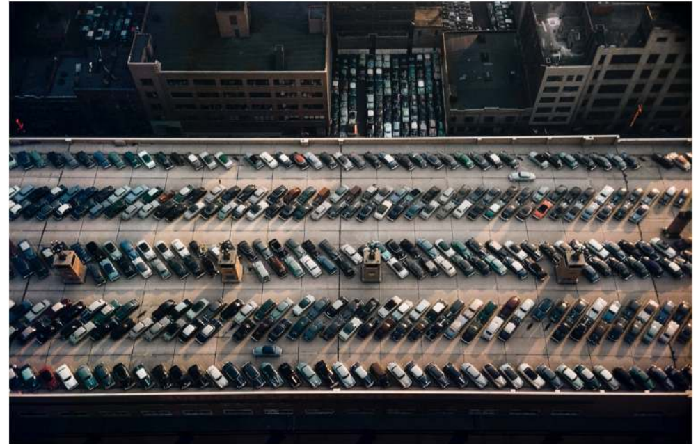
Roof of Bus Terminal, New York, 1953