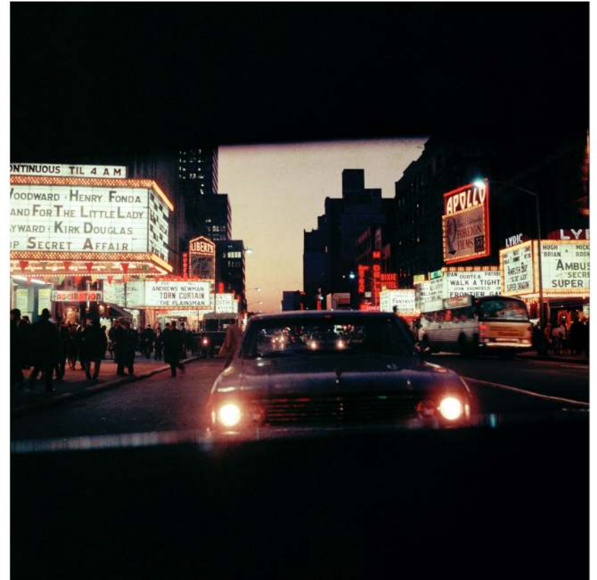
42nd Street at Night, New York, 1966