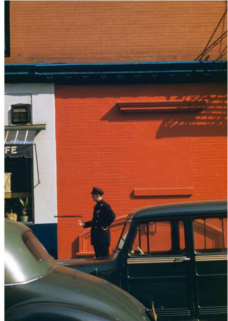
Cop Tossing Night Stick, New York, 1953