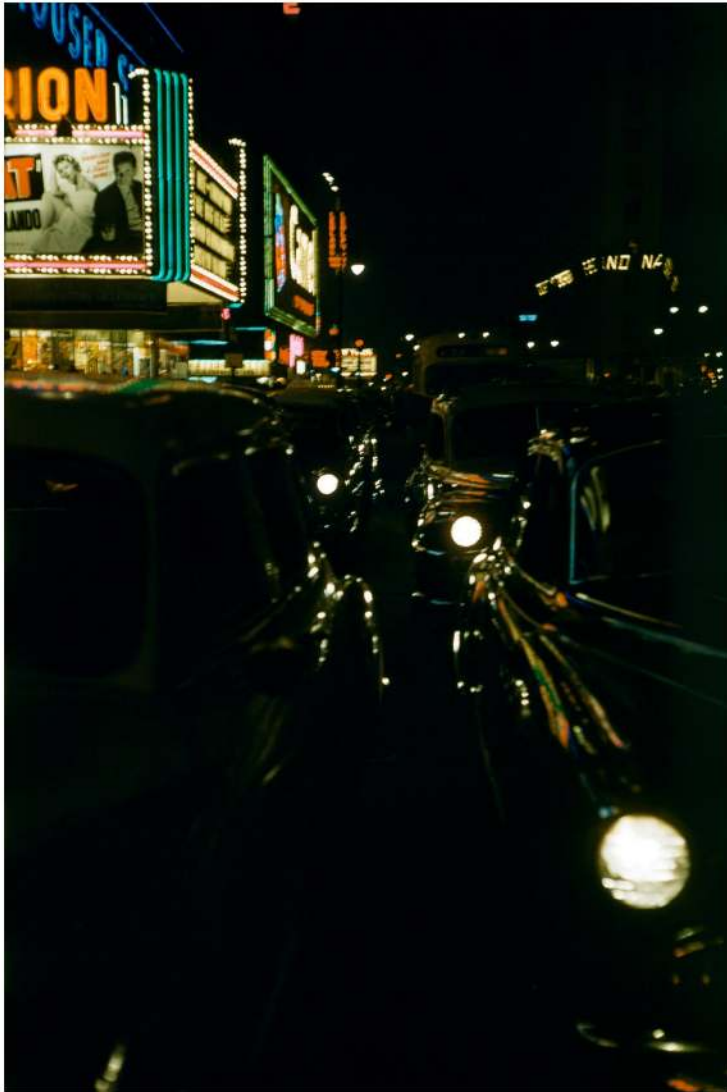
Cruising at Night #1, New York, 1953