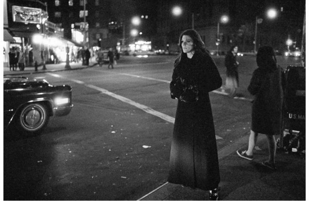
Hailing a Cab, New York, 1969