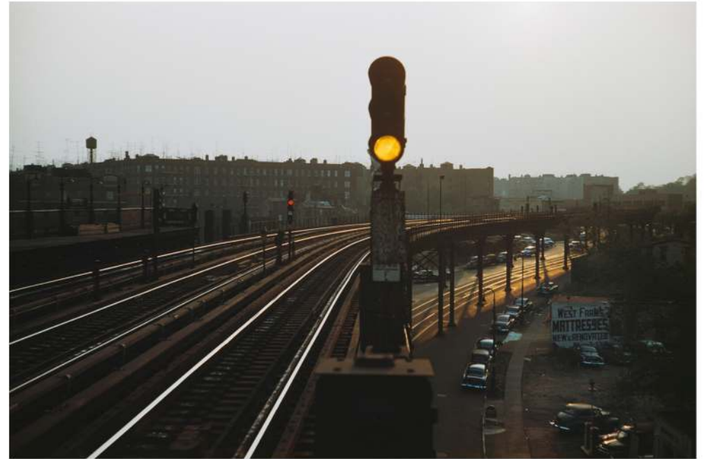
Subway signal, New York, 1953