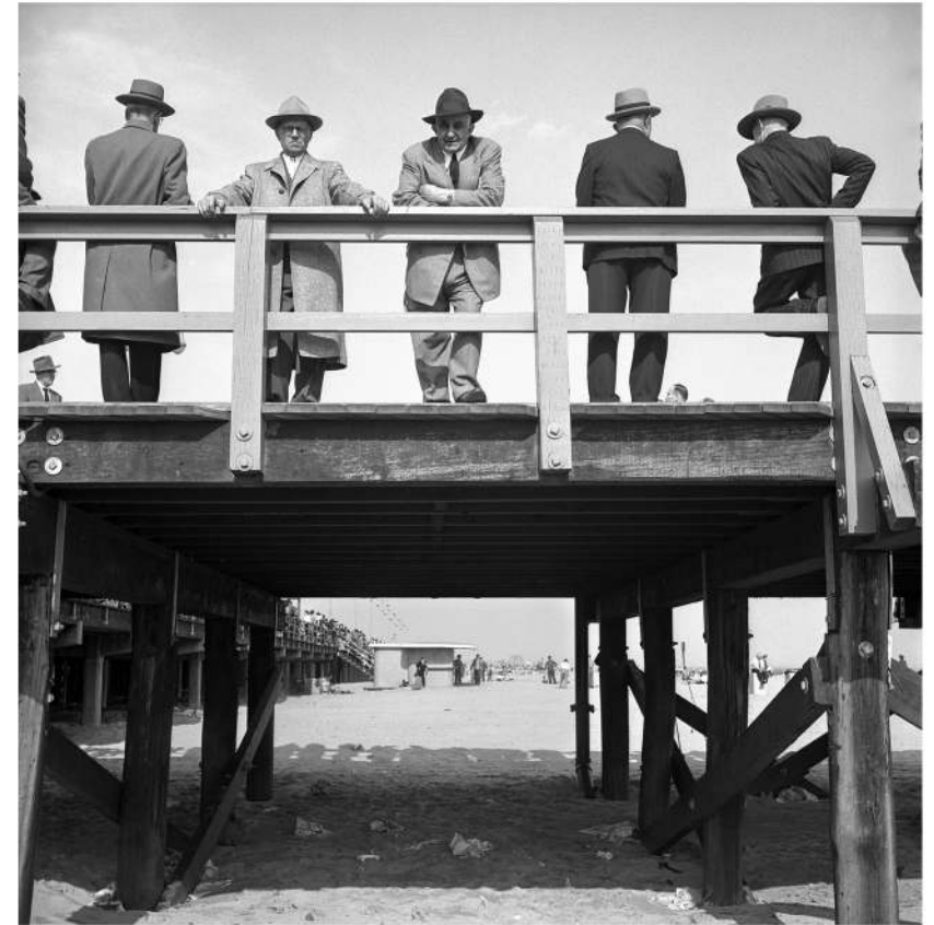
Men in Fedoras, Coney Island, 1950 20 x 16 in. (50.8 x 40.6 cm) fibre-based silver gelatin print, printed 2012 Signed by the artist in ink on recto GBP 3,825 inc. VAT, unframed / USD 4,500 for export

‘One of the most accomplished recorders of the American experience’ New York Times