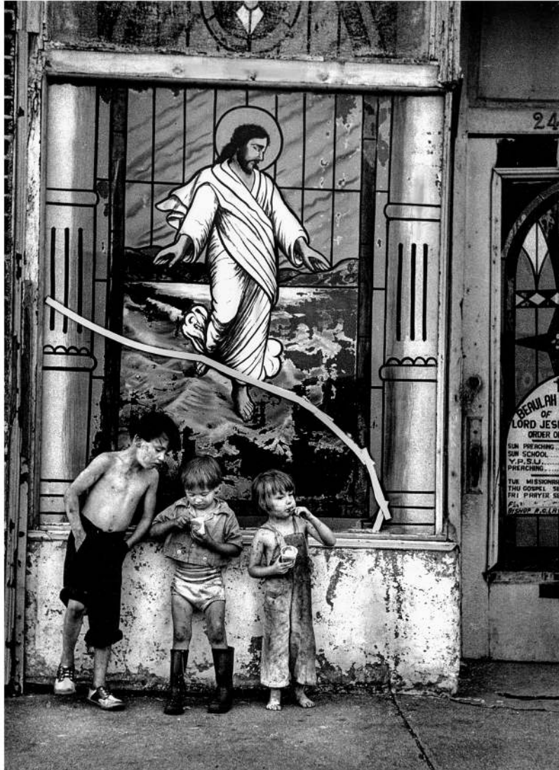
Broken Christ with Children, Coney Island, 1950 14 x 11 in. (35.6 x 27.9 cm) fibre-based silver gelatin print, printed 1970s Signed by the artist in ink on recto GBP 5,300 inc. VAT, unframed / USD 6,250 for export