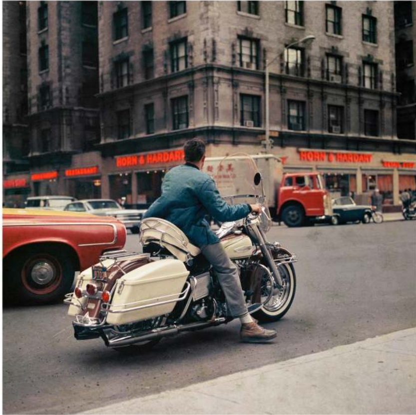
Harley Davidson Rider, New York, 1966